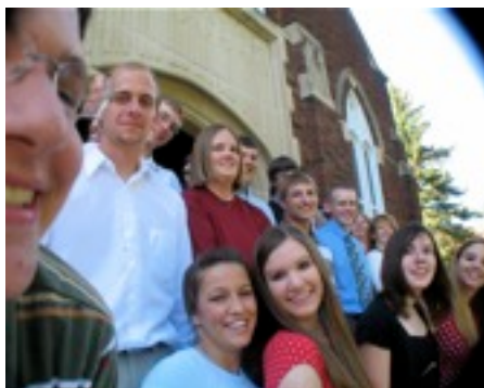
North Dakota Lutheran Youth Fellowship These folks have asked us to come to every one of their summer gatherings... this is the group that gets to hear our experimental / new songs first and they still keep asking us to come back!

Celebration Extravaganza (F.A.C.E.) at tangledblue.com and on our new photo journal at www.web.mac.com/tangledblue . Our final California performance of the summer was hosted by the fine folks at Davis Lutheran Church on the evening of July 22. After packing up we drove, bleary eyed, to Reno. We made a lot of new friends in central California this summer. Thanks to all of the folks who helped us pack up our stuff and put little notes of encouragement in our gear bags for us to find later.